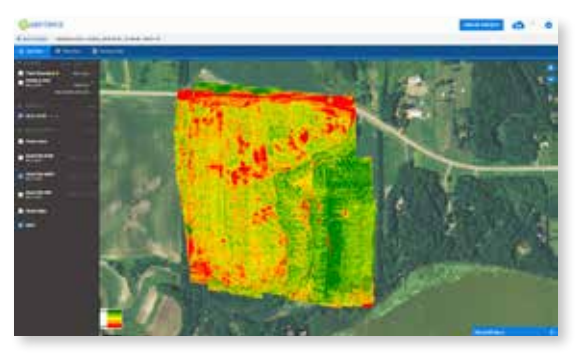
Sentera AgVault desktop software

AgVault™ software unlocks the value of your data. Create shapefiles, QuickTile™ maps, organize, store, view, annotate and share images with teams and partners, expanding the circle of impact. You can even fly several DJI drones using your iOS device and AgVault Mobile. AgVault software is compatible with all popular agricultural analytic tools, creating a seamless flow of imagery and data from capture to detailed analysis.