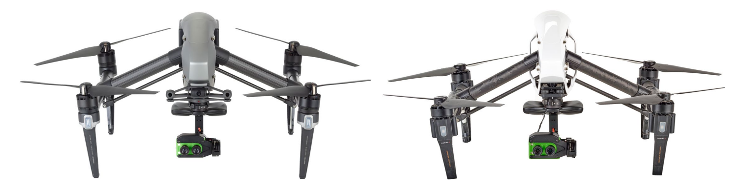
Inspire 2 with aimbaled Double 4K Sensor

Whether you are an agronomist, crop consultant, advisor, or grower; the Inspire family of crop scouting upgrades allows you to leverage a multitude of sensors using plug-and-play technology while leveraging a single drone platform. Choose between the Inspire 2 or Inspire 1 quadrotor drone as your tool to capture vegetative indices and leverage near real-time crop health data both on and off the farm.