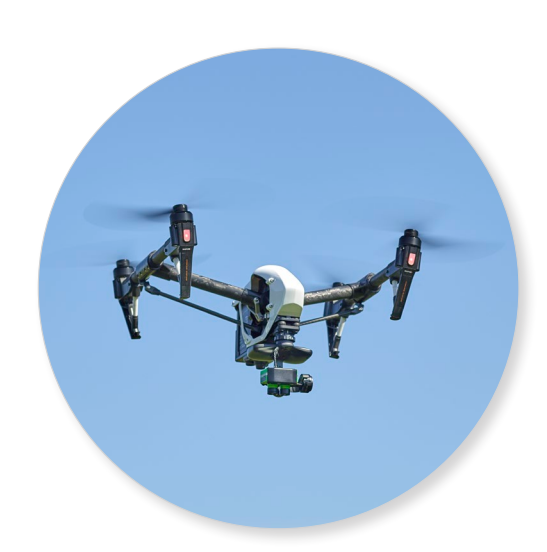
Transform a DJI Inspire 1 or 2 drone into a precision scouting tool