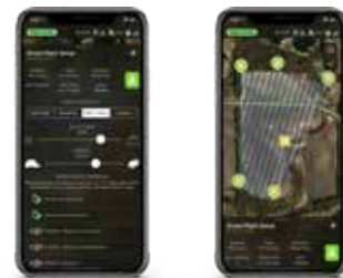
FieldAgent Mobile iOS