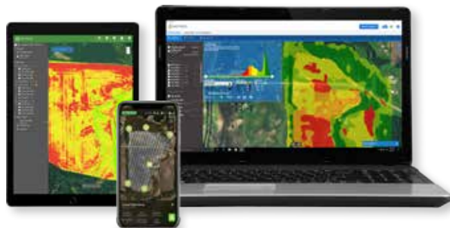
FieldAgent Web, Mobile, and Desktop

Our FieldAgent Platform is a complete agricultural data analytics solution that's with you wherever you are — in the office or in the field. Coupled with a Sentera precision ag sensor, FieldAgent takes you beyond aerial photography into meaningful data products with actual economic value, such as NDVI and NDRE zone analysis, population analysis, weed mapping, and elevation mapping.